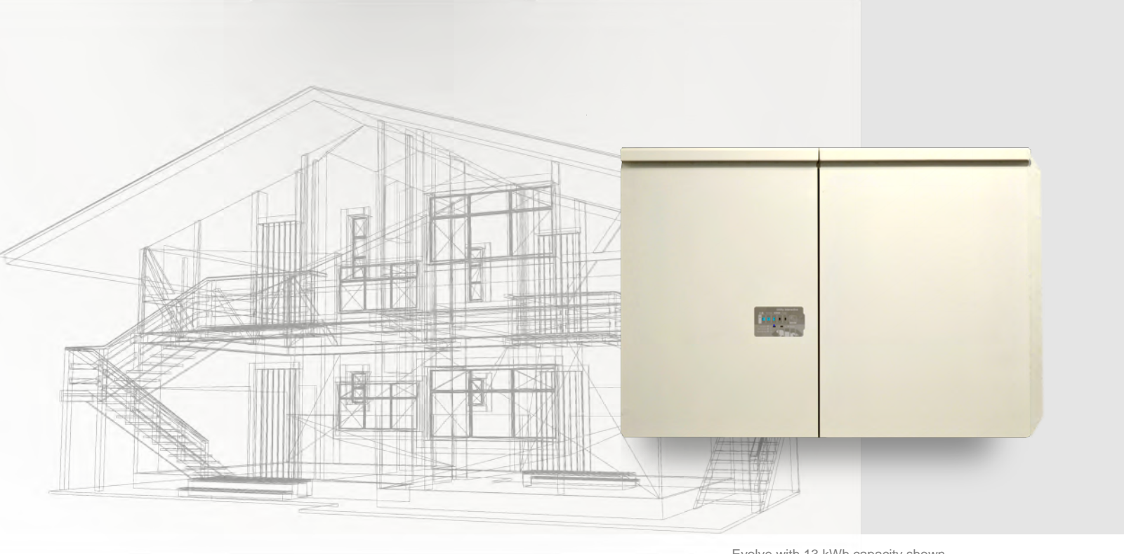
Evolve with 13 kWh capacity shown.