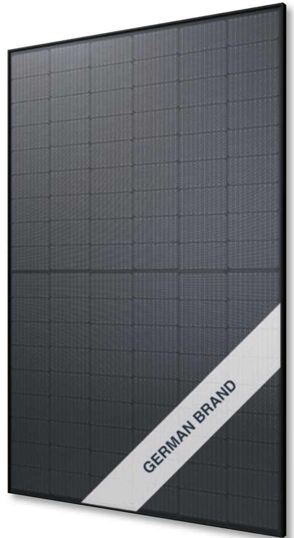
Fig. similar 08MHE221208A