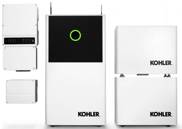
20 kWh Model