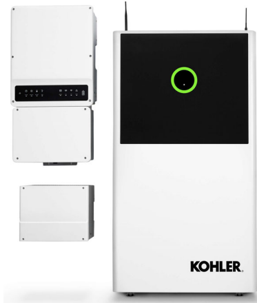
10 kWh Model