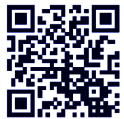
Scan QR Code from your smartphone for more information

t: 1-888-365-ASKGB (US Customers) t: 703-657-0090 (Int. Customers) f: 703 - 463-9543