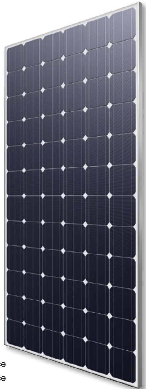
Fig. similar 72M156USA170727A

IP 67 High quality junction box and connector system for a longer life time