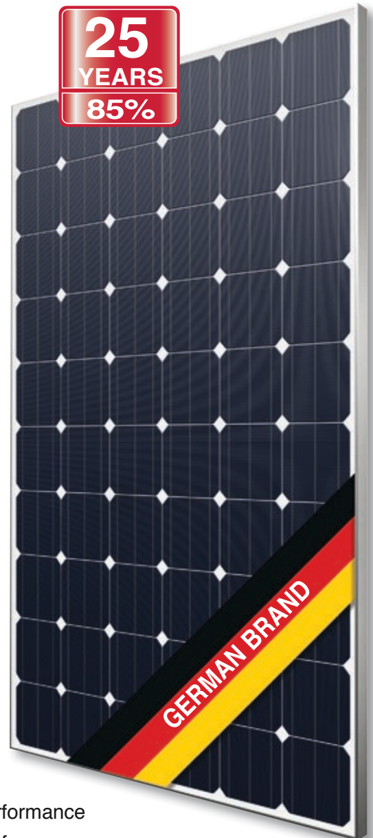
Fig. similar 60M156EN150505A

Exclusive linear AXITEC high performance guarantee!